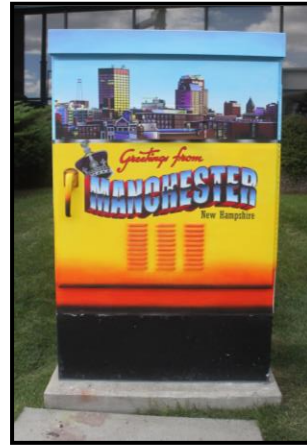
Image: Traffic Signal Box at Granite and Elm before and after, by Rob Sardella 2014